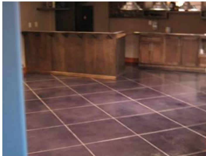
WHITE CONCRETE, GROUND AND STAINED