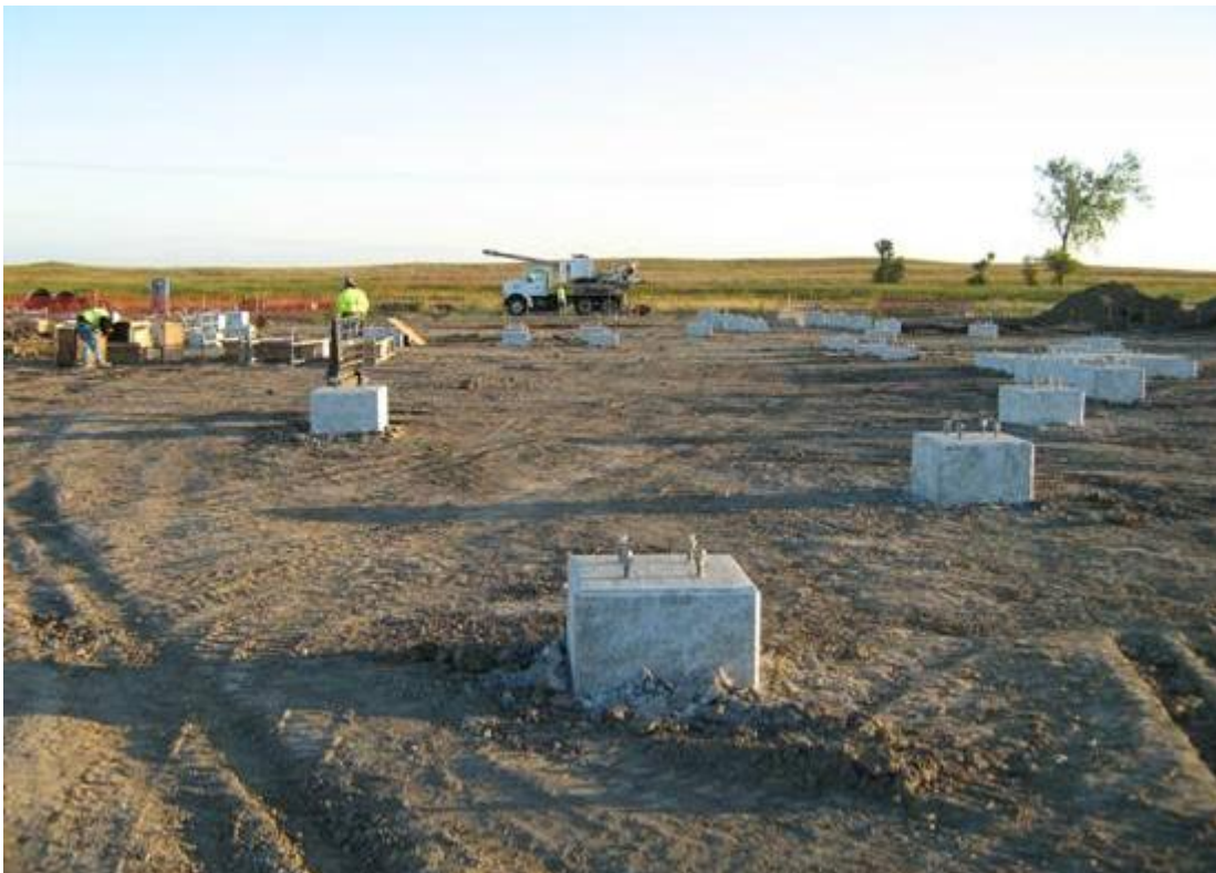
SQUARE TOP PIERS WITH DRILL TRUCK IN THE BACKGROUND

KEY HAS POURED PIERS FOR WIND ENERGY PROJECTS, ELECTRICAL TRANSFORMER STATIONS AND CELL TOWERS.