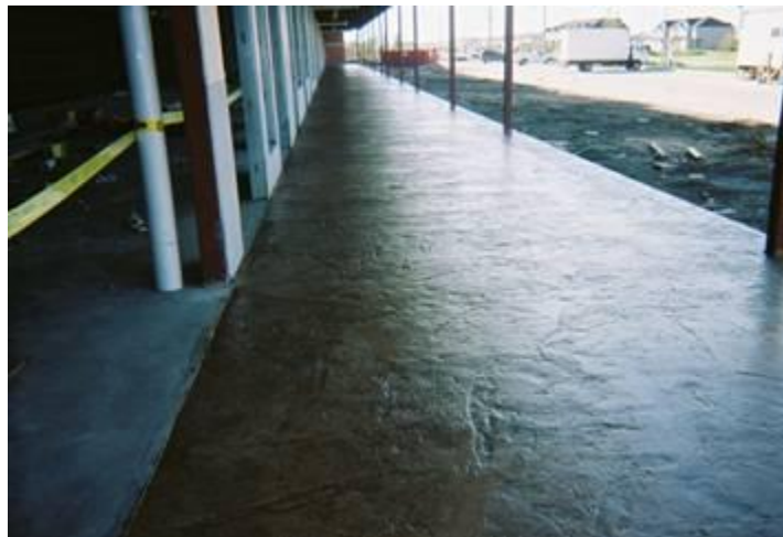
COLORLED, STAMPED COMMERCIAL WALKWAY