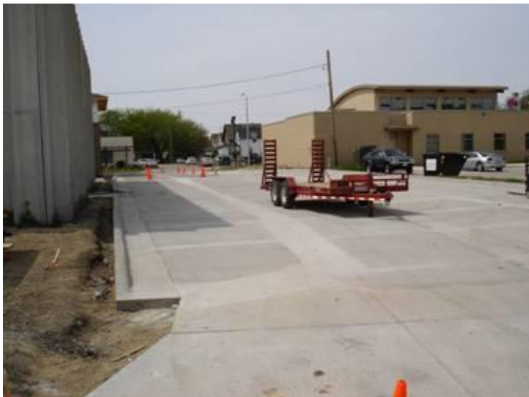
PARKING LOT – DOWNTOWN FARGO