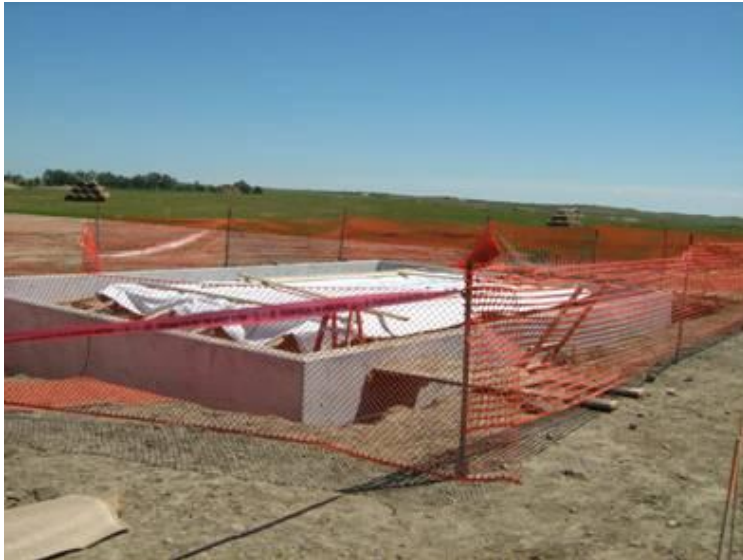
CONTAINMENT STRUCTURE – WIND ENERGY TRANSFORMER STATION

SOME PICTURES OF KEY'S CONCRETE PROJECTS: