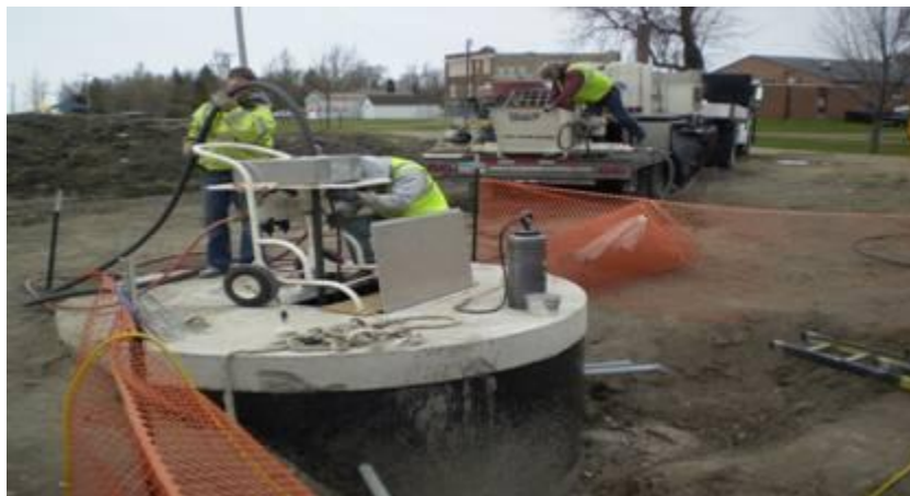
MANHOLE REHABILITATION SETUP