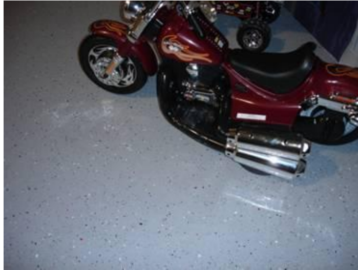
MONSTER GARAGE FLOOR – EPOXY AND URETHANE

HERE ARE SOME PICTURES OF KEY'S RECENT FLOORING PROJECTS: