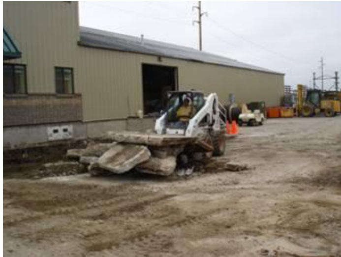
INDUSTRIAL PAVING REPLACEMENT