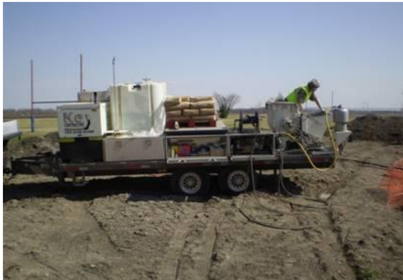
MANHOLE REHABILITATION TRAILER

SOME PICTURES OF THE REHABILITATION PROCESS: